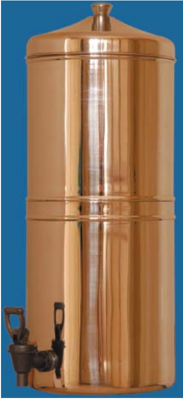
Image 2.3.1 The Water4life Gravity Unit

Before the water is allowed to flow in the lower bucket, it has to pass 2 or 3 physical barriers (see image 2.3.2).