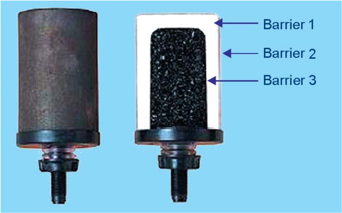
Image 2.3.2 Rendition of the Water4life filtercandels.

Before the water is allowed to flow in the lower bucket, it has to pass 2 or 3 physical barriers (see image 2.3.2).